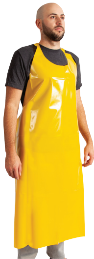
Die Cut Polyurethane Aprons